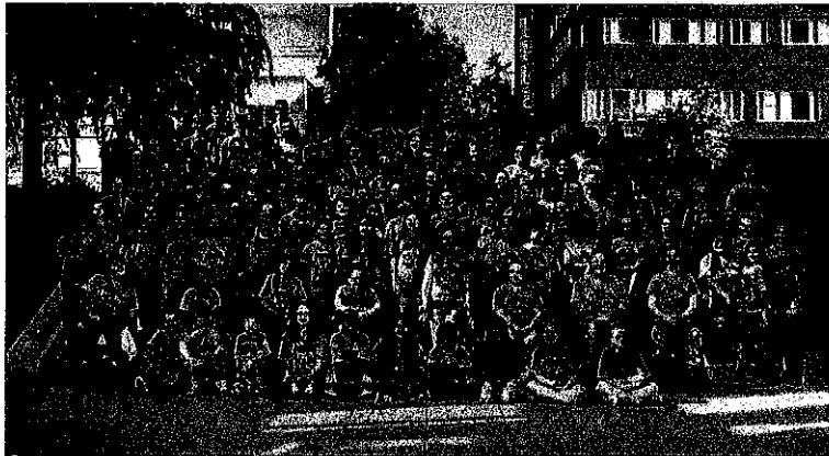
2016 Youth Rally Campers – check out www.YouthRally.org for additional photos & videos!

A PICTURESQUE SETTING The 2016 Youth Rally was hosted at the University of Washington (UW) in Seattle where participants had the luxury of staying at the campus' new downtown dorms. This was the Youth Rally's 2 nd visit to Seattle (the first was back in 2013) – and it didn't rain one time once the campers arrived. From the campus center were clear views of Mt. Rainier! Hot sunny days and cool nights were the setting for a jam-packed week of learning, fun, and adventure!